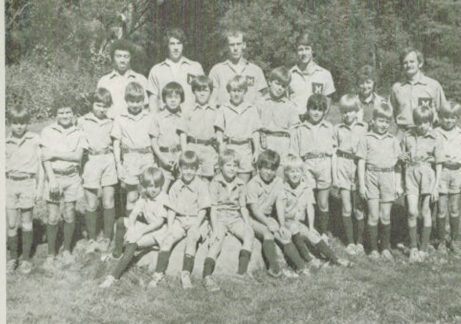
THE 1980 CUBS