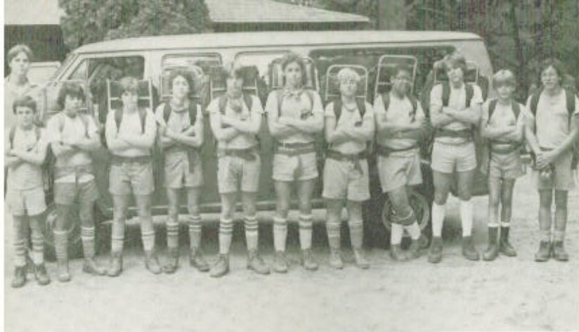
1980 GOPHER SQUAD