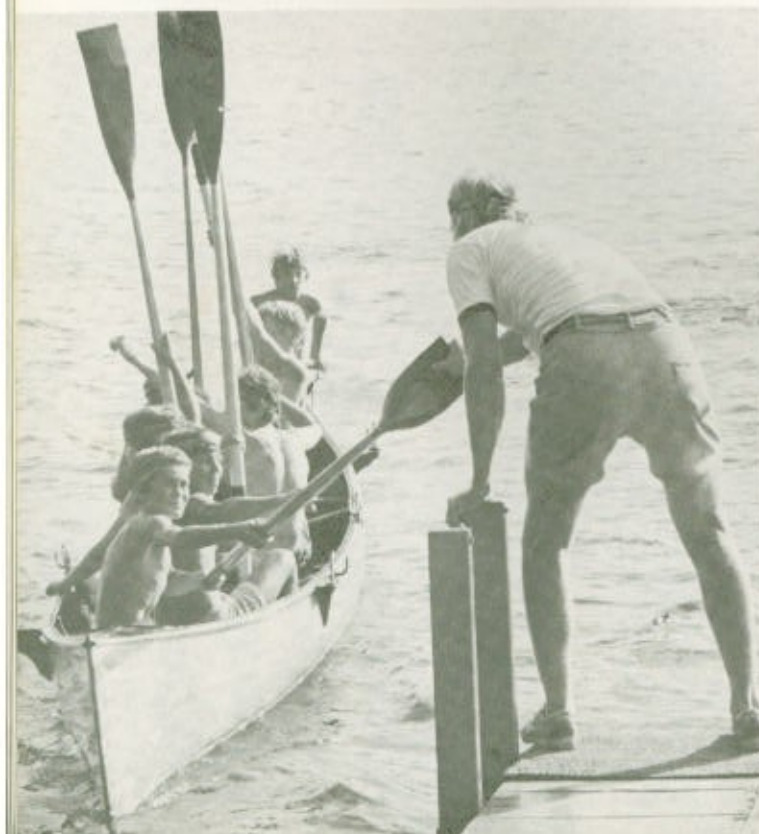
THE ELIZABETH FORD HOLT