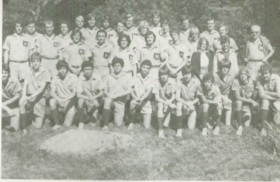
THE 1980 MOWGLIS STAFF