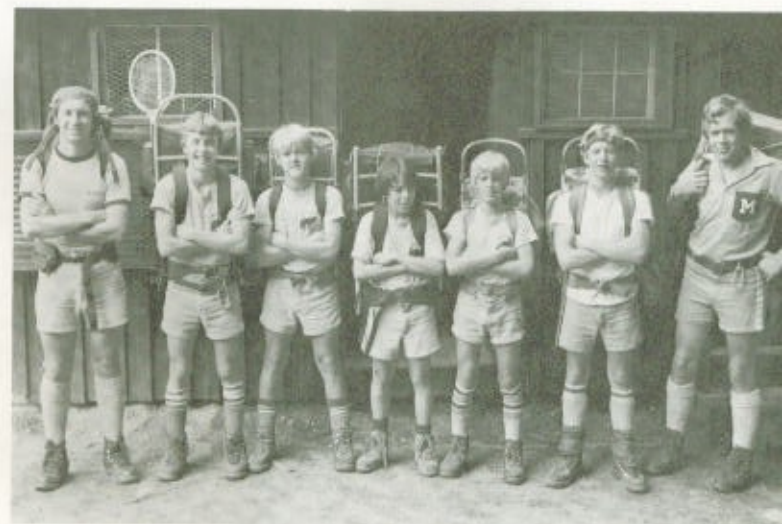
THE 1980 MT. WASHINGTON SQUAD