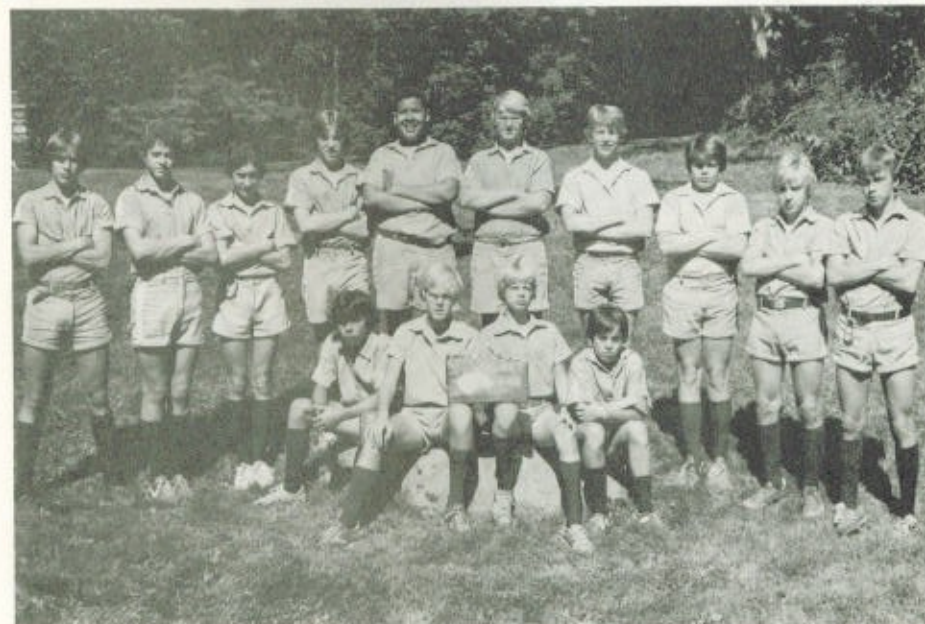
THE MOWGLIS GRADUATES OF 1980