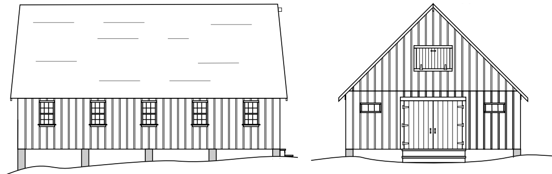
The Mowglis Woodshop