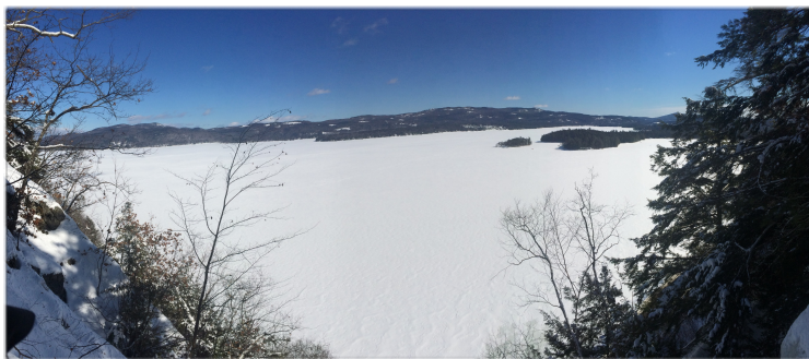
Frozen Newfound Lake from Big Sugarloaf. The ice is 27" thick!