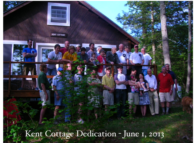
Kent Cottage Dedication - June 1, 2013