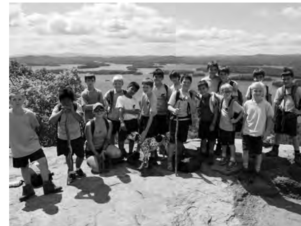
Cubs and Toomai at Squam Lake