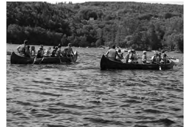
Cub Race on Crew Day