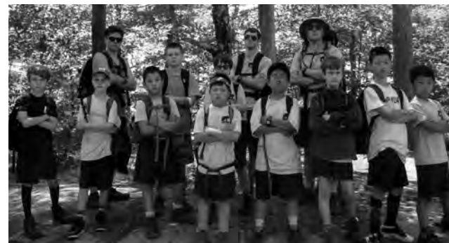
Baloo Trip Day