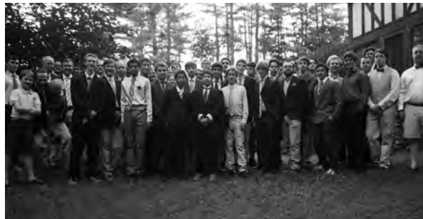
2015 Graduates' Dinner Reception

Candle Boat building in the Craft Shop was in high gear, as boys and staff built traditional and unique boats to be launched. One of the largest groups of Graduates and guests attended Graduates Dinner to celebrate and honor the Den Graduates. Final safety and ribbon requirements were earned on the final day of Industries in preparation for the Inner Circle Ceremony. The final day was as fast-paced as usual, with packing, tournament finals, and enjoying the final hours on the clear waters of Newfound Lake, all before the beloved Candlelight Chapel Service and Candle Boat launching.