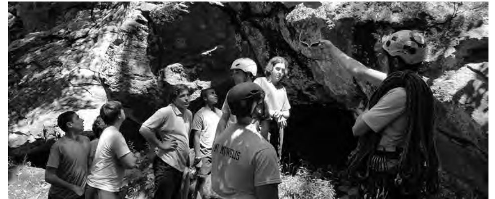
Yearlings rock climbing