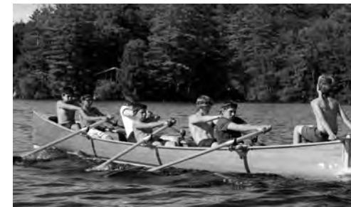
Blue Racing Crew