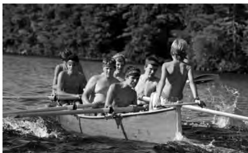
Red Racing Crew