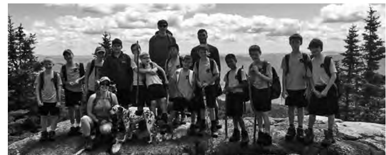
Toomai Trip Day