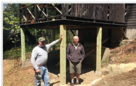
Refurbishment of the Chef's Cottage