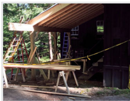
New Pottery Center at the Craft Shop