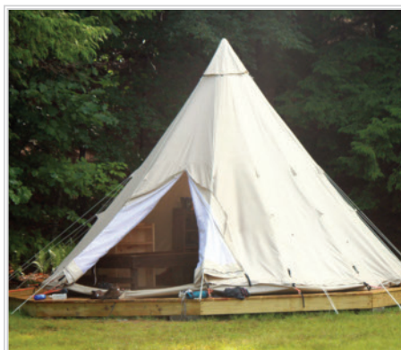
New Tipi at Cubland

Support your crew today! Give at www.Mowglis.org