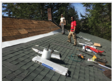
New Roof on the Craft Shop