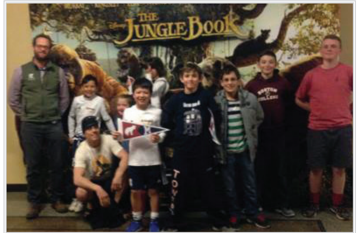
Mowglis campers, alumni, staff, and friends gathered to watch the new Jungle Book Movie and celebrate Camp Mowglis's amazing origin story!

Throughout his life, Mr. Kipling maintained an active interest in this undertaking so strongly influenced by his exciting stories.